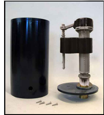
PHOTO NOTE: UNIT SHOWN WITH INTERNAL FLOAT VALVE ASSEMBLY REMOVED.

SPECIFICATION DATA: Mechanical Riser Mounted Water Level Control System, adjustable mechanical float type water level control in PVC cylindrical housing, with black epoxy finish, removable bottom plate, stainless steel fasteners and 3/4"(F) N.P.T. brass C.W.S. connection ( from backflow protected source ).