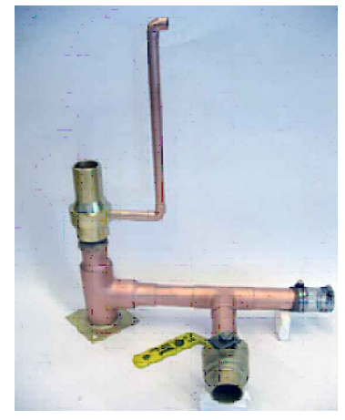
STAND SHOWN WITH RBN-SERIES BUBBLER NOZZLE (NOT INCLUDED)