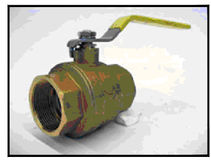
Appearance may vary according to size and supply available.

For submersible applications, remove handle and store in safe place after adjustment.