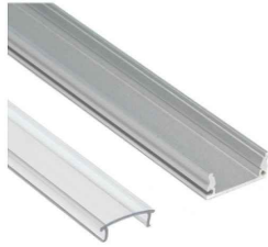
OPTIONAL MOUNTING CHANNEL