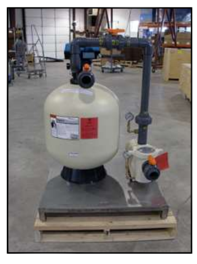
SHOWN WITH OPTIONAL CHECK VALVE