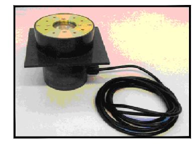
SHOWN WITH RFL-33-BC SERIES LIGHT FIXTURE (SEE DWG. 5.6b)