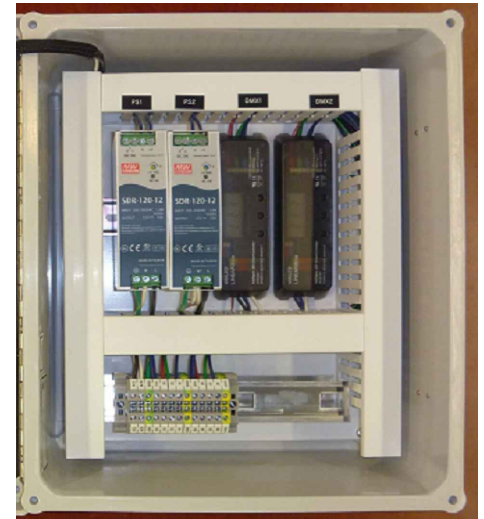
TYPICAL INTERIOR VIEW